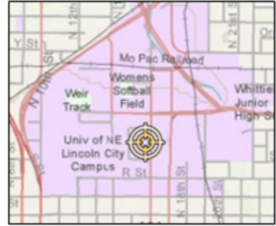
University of Nebraska – Lincoln