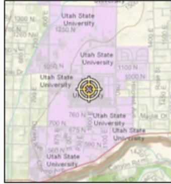
Utah State University