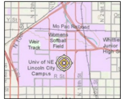
University of Nebraska–Lincoln