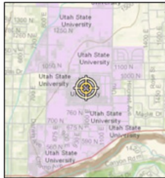
Utah State University