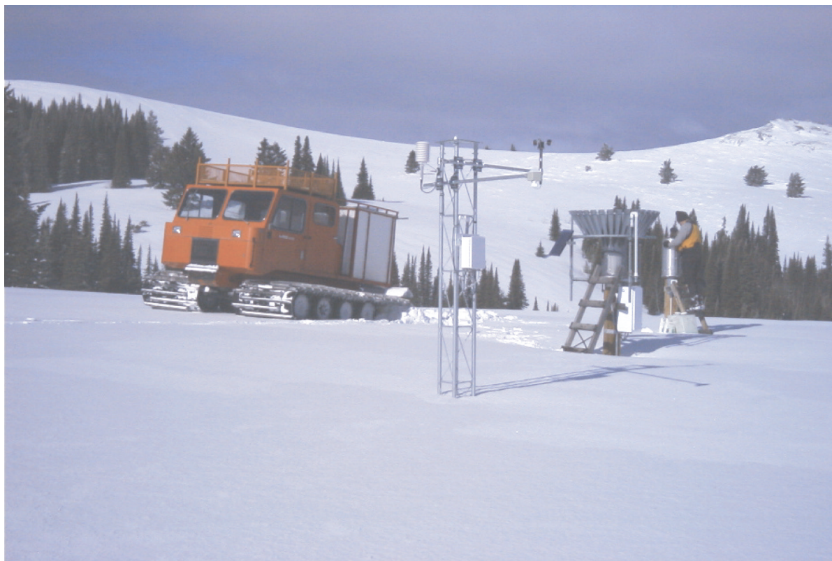
Plate 2. Climate, snow, and precipitation measurement site near fir forest in the southern, higher elevation region of the Reynolds Creek Experimental Watershed during December. Sno-cat is used for instrument maintenance and data collection during winter.