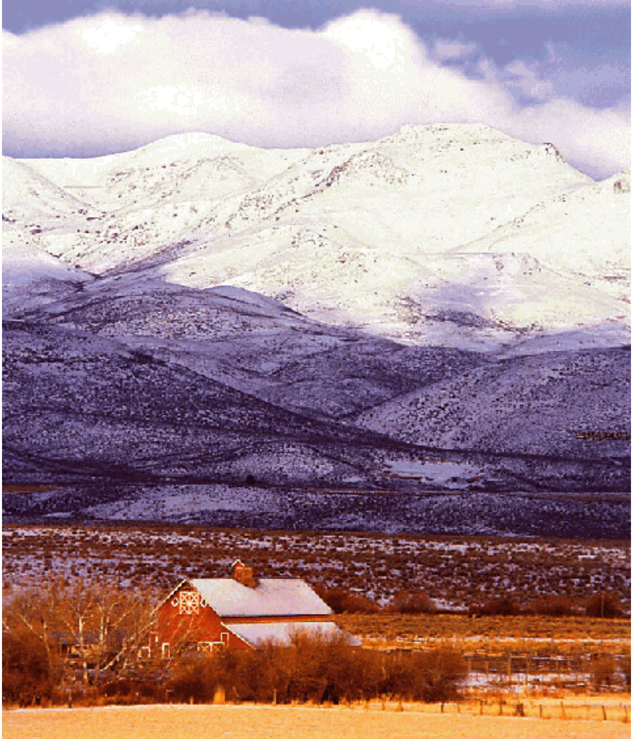
Plate 1. View of the Reynolds Creek Experimental Watershed looking up from the Bass ranch to the northwest ridge in February.